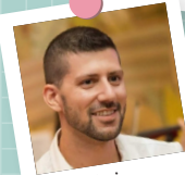
Din Customer Success